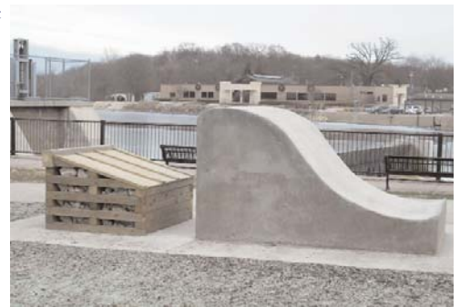
A replica of materials used to construct an earlier version of the Waverly dam is seen with a sample of the material used to construct the new inflatable dam.