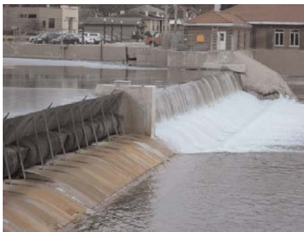
A view of the Waverly inflatable dam from the west.