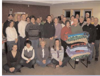
INRCOG Staff and Family members pose with blankets made and donated to the Salvation Army.

During the Annual INRCOG Christmas Party, staff and their family made thirteen fleece blankets which were donated to the Salvation Army to be given to its clients and used in Salvation Army shelters.